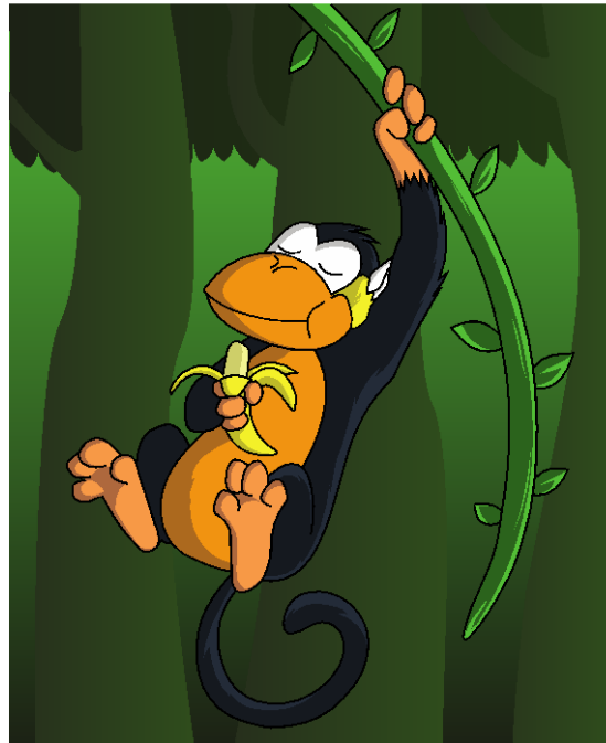
Mojo Monkey likes to eat. He wants dental sealants to protect his teeth.