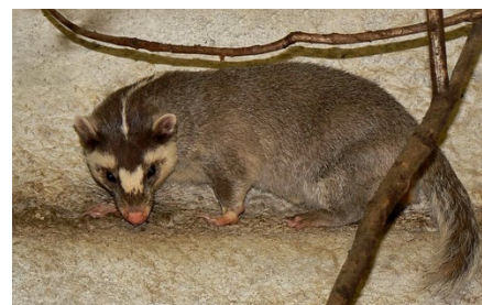
Chinese ferret-badger

Reports of anthrax in humans, sometimes without a known animal source, came from Republic of Georgia, Kenya & Zimbabwe, and in livestock without associated human infection from Argentina, Indonesia, Sweden & Togo. Rabies cases were reported from India, Indonesia and South Africa, and in animals without associated human cases in the Congo Republic, Israel, Taiwan and the USA. The Taiwan infections were first discovered last year in Chinese ferret-badgers, which are a species of the mustelid family living in the mountain forests, among which rabies may have been lurking undetected for decades.