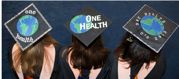
University of Florida MHS graduates' mortarboards celebrate the focus of their degrees

This past December at the University of Florida three students graduated from the first ever Master of Health Science (MHS) Environmental and Global Health (EGH) One Health concentration degree program in the United States.