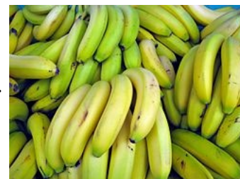
Cavendish bananas

Noteworthy was the first report of the virulent TR4 race of Panama disease in banana in Africa (Mozambique), from where it is spreading around the continent. It was already decimating Cavendish bananas throughout Southeast Asia, and in November 2013 was reported in Jordan. It is of particular concern because the Cavendish banana is the main commercialized type of banana, which is resistant to all other races of Panama disease.