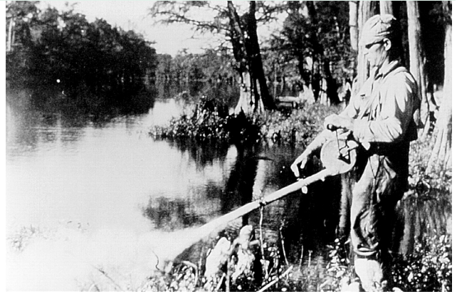
Spraying of DDT for mosquitocidal purposes

effect of DDT on the environment was made public and elimination efforts were halted 11 . Consequently, over the next several decades mosquito populations gradually re-established themselves in the U.S. and abroad. As the burden of dengue in the tropics began to increase in the 1980s and 1990s and Americans began to travel internationally more frequently, more and more travelers began to return to the U.S. with the unwanted souvenir of dengue.