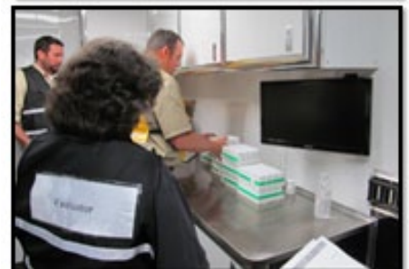
Individuals simulate dispensing human antiviral medication in the event of an outbreak