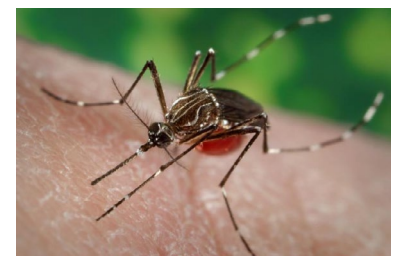
Aedes aegypti mosquito

Despite relatively low case counts in recent decades, dengue is no stranger to the United States. Dr. Benjamin Rush, a signatory of the Declaration of Independence, documented a dengue outbreak in Philadelphia in 1780. Ships arriving from foreign ports were bringing mosquitoes and infected people back to port cities in the U.S., where local outbreaks then followed. This continued along the eastern seaboard and Gulf coast for the next 150+ years: an outbreak in 1873 10 affected an estimated 40,000 residents of New Orleans, and another in 1922 10 made its way through the entire Gulf. The last major outbreak in the continental U.S. occurred in 1945 when a soldier returning from Guyana came home with him, resulting in an outbreak in which 145 people were affected.