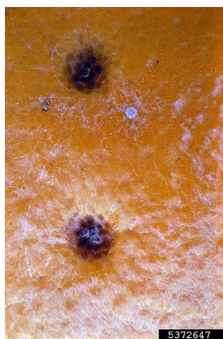
Citrus Black Spot

Not only staple crops but also fruit and nuts are being attacked by diseases spreading globally. Beside the outbreaks listed above, in the three months ending 28 February 2014 the world has seen outbreaks of other diseases in: wheat (Australia, India), rice (India, Viet Nam), potato (USA), coffee (Mexico), almonds (USA), avocados (Colombia), cashew (Tanzania), little cherry (Australia, USA), grapevines (also Australia, USA), papaya -- two different diseases (Mexico), pecan nuts (USA) and tomato (USA).