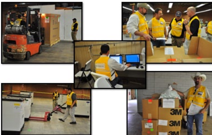
Pictured above: Participants in charge of supply distribution execute efficient dispersal of supplies during the exercise.